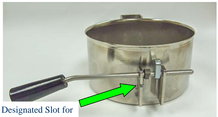
Designated Slot for U-Shape part of the spring.